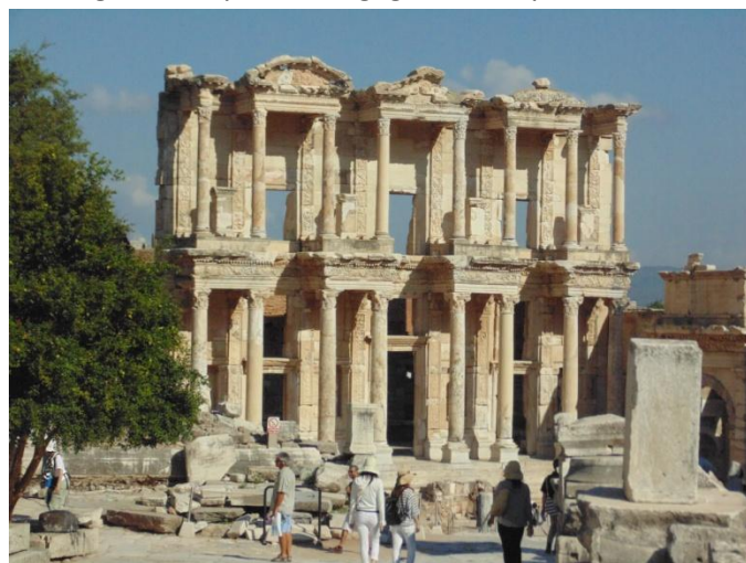
The library at Kusadasi, Turkey.

overwhelming citizens with malaria. The city simply faded away. It was a beautiful and literate place, housing the largest library of the time, and it was easy to imagine the apostles engaged in lively debates there.