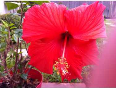
Straight from the Deaton's garden is this picture of a beautiful hibiscus.

Got a picture you would like to share. Send it to us. Even if it wasn't taken in summer, we'll pretend it was.