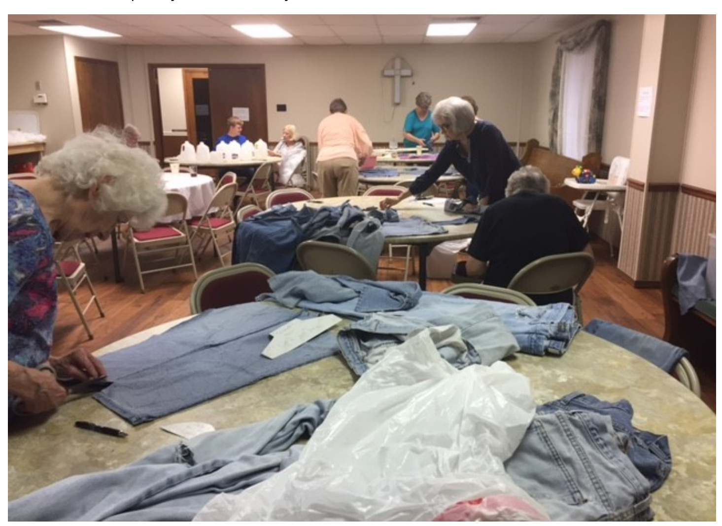
Hands were busy, but the work was enjoyable on Sunday, May 21, as volunteers cut denim and plastic into shoe parts.

To read previous issues of the Innovator, <u>click</u> <u>here</u> to visit the PW page on the Grace Presbytery website.