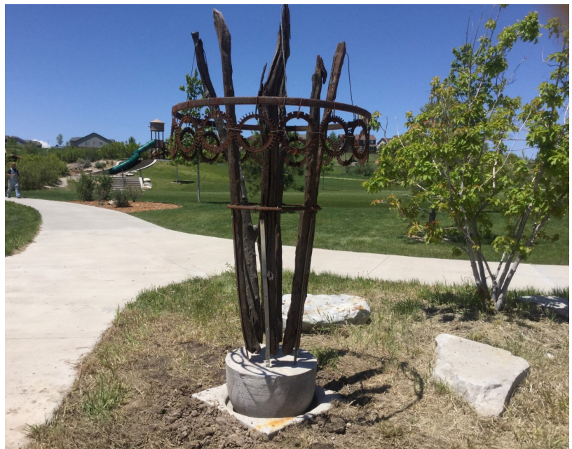
Iron Tree in its new location in Castle Rock's Wrangler Park.

Each was inspiring of itself. The final one was "I dream of a day when children will grow up in a psychological, educational, and ecologically safe and friendly environment."