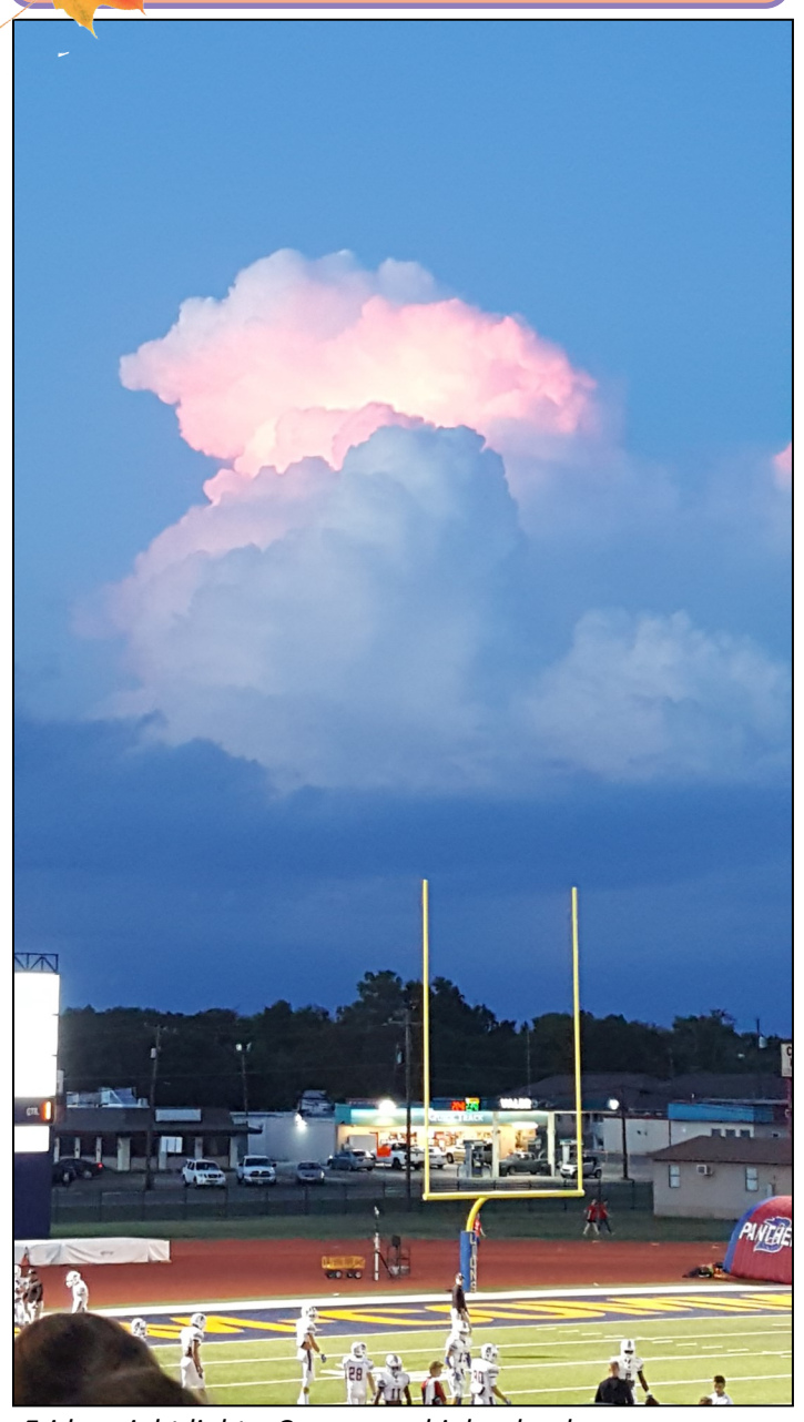
Friday night lights. Commerce high school game.