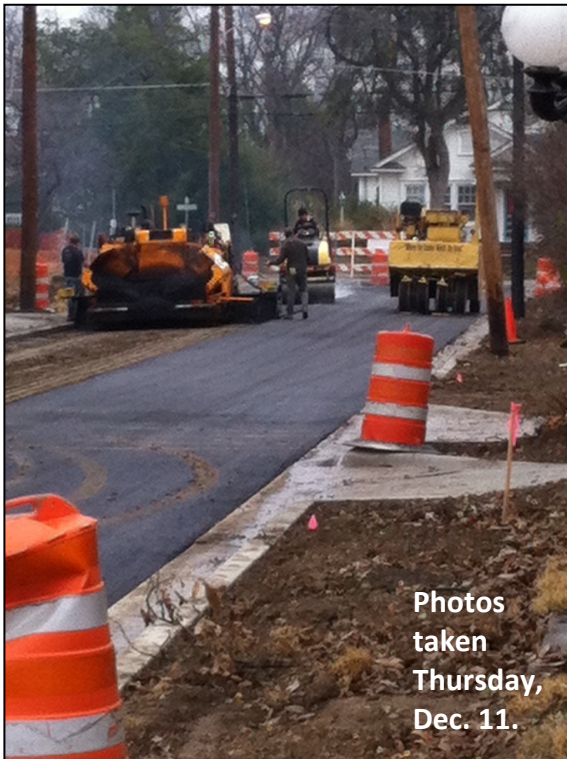
Photos taken Thursday, Dec. 11.