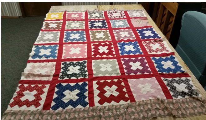
This was the original unfinished antique quilt top that has now been completed.