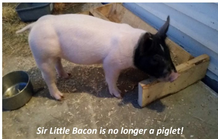
Sir Little Bacon is no longer a piglet!

The Dec. 21 kissing ceremony after church may have to be held outside. (Please bring your cameras to the stew luncheon.)