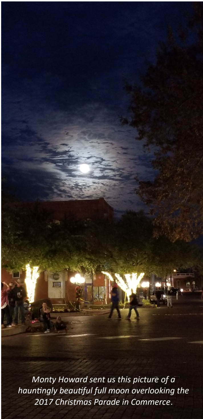
Monty Howard sent us this picture of a hauntingly beautiful full moon overlooking the 2017 Christmas Parade in Commerce.