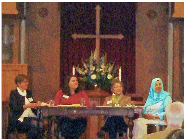
Panel shows diversity at Women in Faith Conference.