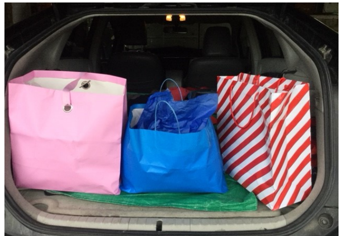
The last three bags have been loaded and delivered..

Thank you to everyone who helped with this mission to our community!